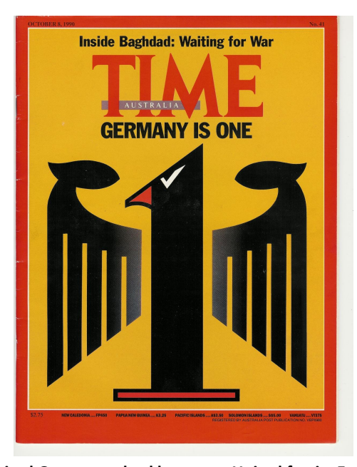
A united Germany – backbone to a United fascist Europe!

That is why I believe that "Ezekiel's Message" could also be called "The Captivity Doctrine".