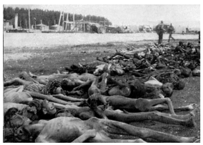
Are concentration camps coming back?

The booklet was laced with startling graphics portraying the end times, tribulation, Day of the Lord and the Wonderful World Tomorrow. It woke up many people and led them to Christ. Let us now attend to another article.