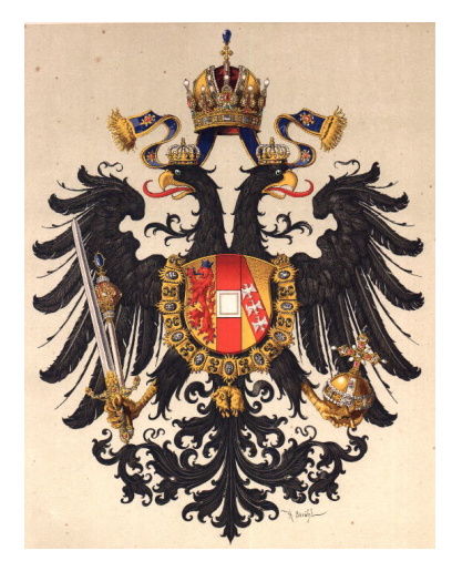
The double-headed eagle - symbol of western and eastern Europe operating as one.

We need to be earnest as Matthew Henry declares – fired up with real ZEAL to reach out to warn our peoples before it is too late! We should not be jealous of the zealous ones and denounce them – but supportive of them. The big question is whether we have love for our national brethren or a lukewarm and lazy attitude wanting to hide our light under a bushel. Do we want to reach out or protect our hides? Do we have a give or a get attitude? Remember what our Bible warns us about: those who wish to save their lives will inevitably lose it.