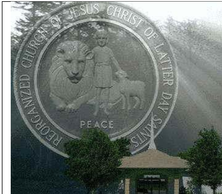
An earlier version of the RLDS seal superimposed behind the church's Modesto, California chapel.